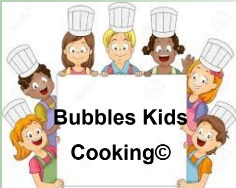
Cooking for lifelong learning

Research tells us that children who have been exposed to domestic violence, often repeat these learned behaviours as it becomes ‘the norm’ hence Bubble Kids Cooking becoming an early intervention and prevention program. The therapeutic framework for this 6 week program is based on the theories of Vygotsky’s socio cultural theory of human learning; whereby the environment in which children grow up will influence how they think and what they think about.